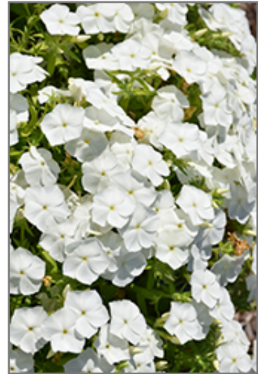
Gisele White Phlox flowers

This plant will require occasional maintenance and upkeep. Trim off the flower heads after they fade and die to encourage more blooms late into the season. It is a good choice for attracting butterflies and hummingbirds to your yard, but is not particularly attractive to deer who tend to leave it alone in favor of tastier treats. It has no significant negative characteristics.