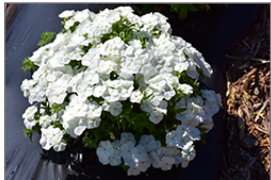
Gisele White Phlox in bloom