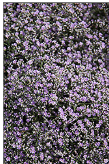
Sea Lavender flowers