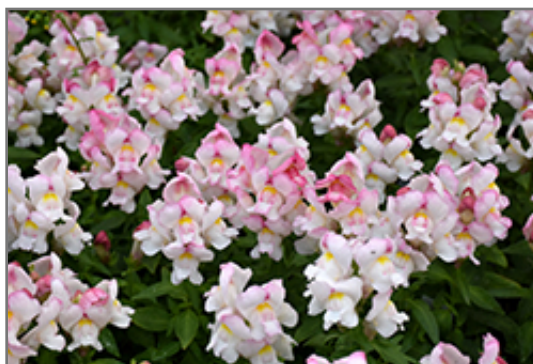
Snapshot Appleblossom Snapdragon flowers