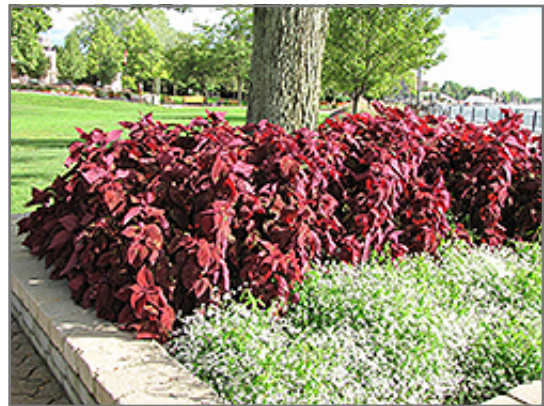
ColorBlaze Rediculous Coleus