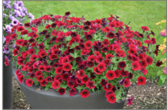
Supertunia Black Cherry Petunia in bloom