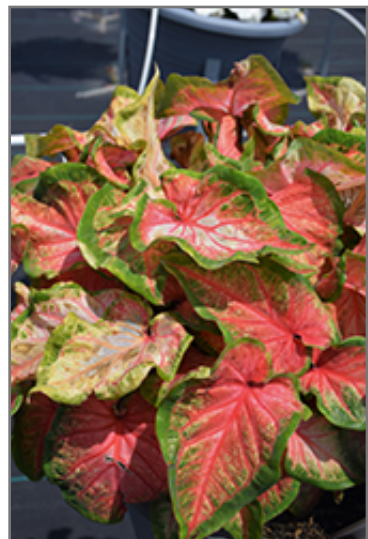
Heart to Heart Chinook Caladium foliage