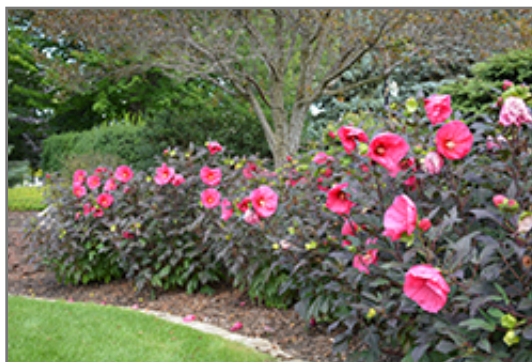
Summerific Evening Rose Hibiscus in bloom