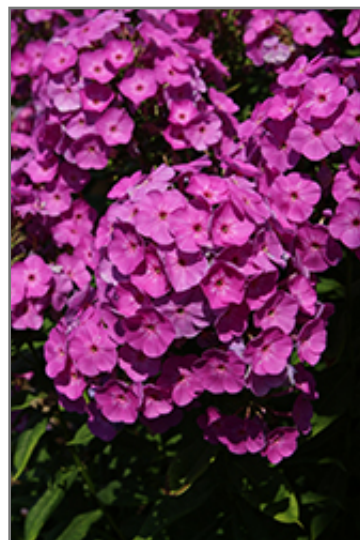
Garden Girls Cover Girl Garden Phlox flowers