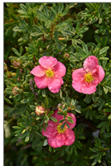
Bella Bellissima Potentilla flowers