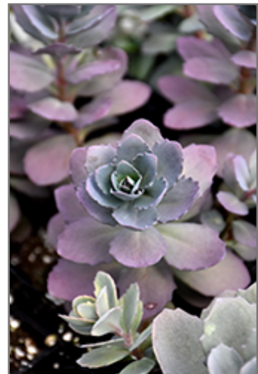
Plum Dazzled Stonecrop foliage