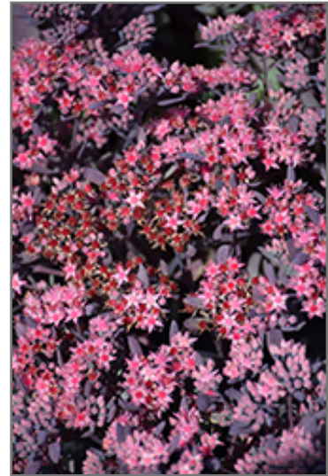
Plum Dazzled Stonecrop flowers

Plum Dazzled Stonecrop is a dense herbaceous perennial with an upright spreading habit of growth. Its medium texture blends into the garden, but can always be balanced by a couple of finer or coarser plants for an effective composition.