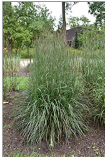
Blackhawks Bluestem in bloom