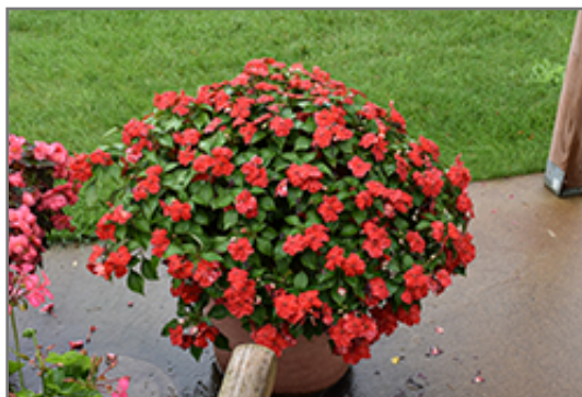
Beacon Bright Red Impatiens flowers

Beacon Bright Red Impatiens is recommended for the following landscape applications;