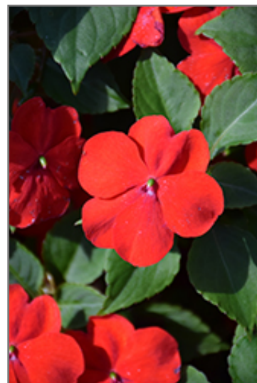
Beacon Bright Red Impatiens flowers