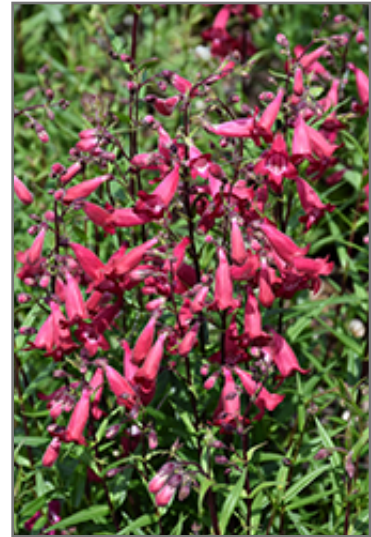
MissionBells Deep Rose Beard Tongue flowers

MissionBells Deep Rose Beard Tongue is recommended for the following landscape applications;