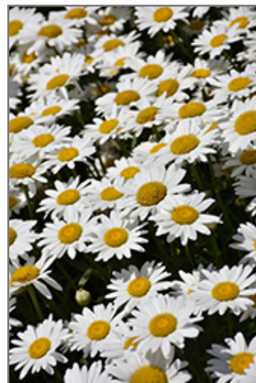
Becky Shasta Daisy flowers