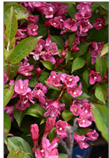
Date Night Strobe Weigela flowers