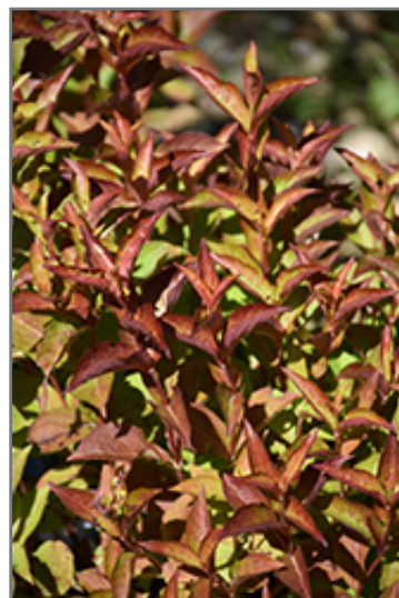
Date Night Strobe Weigela foliage