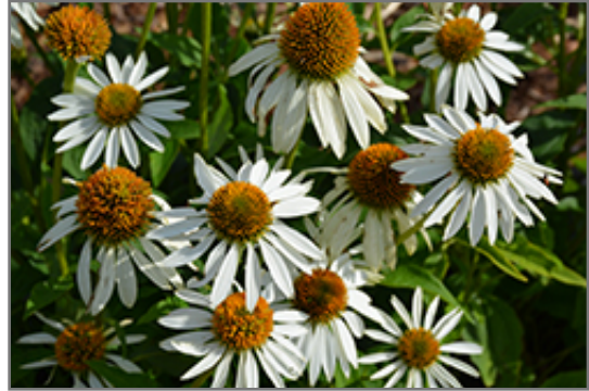
Happy Star Coneflower flowers

This is a relatively low maintenance plant, and is best cleaned up in early spring before it resumes active growth for the season. It is a good choice for attracting butterflies to your yard, but is not particularly attractive to deer who tend to leave it alone in favor of tastier treats. It has no significant negative characteristics.