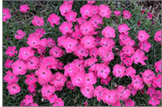
Vivid Bright Light Pinks flowers

Vivid Bright Light Pinks is recommended for the following landscape applications;