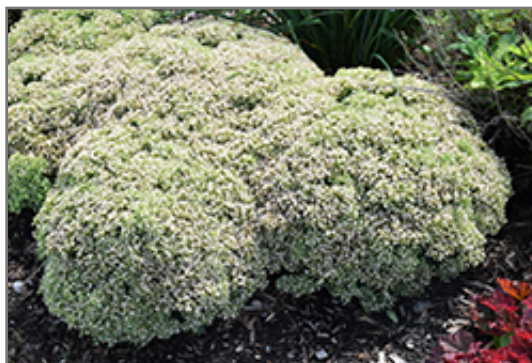
Rock 'N Round Bundle Of Joy Stonecrop in bloom

Rock 'N Round Bundle Of Joy Stonecrop is a dense herbaceous perennial with a mounded form. Its medium texture blends into the garden, but can always be balanced by a couple of finer or coarser plants for an effective composition.