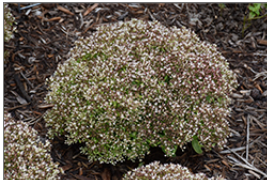
Rock 'N Round Bundle Of Joy Stonecrop in bloom