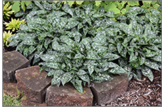
Twinkle Toes Lungwort

Twinkle Toes Lungwort will grow to be about 12 inches tall at maturity, with a spread of 18 inches. When grown in masses or used as a bedding plant, individual plants should be spaced approximately 15 inches apart. Its foliage tends to remain dense right to the ground, not requiring facer plants in front. It grows at a medium rate, and under ideal conditions can be expected to live for approximately 10 years. As an herbaceous perennial, this plant will usually die back to the crown each winter, and will regrow from the base each spring. Be careful not to disturb the crown in late winter when it may not be readily seen!