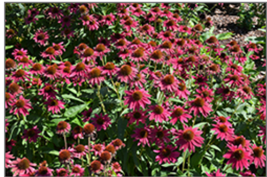
Sombrero Tres Amigos Coneflower in bloom