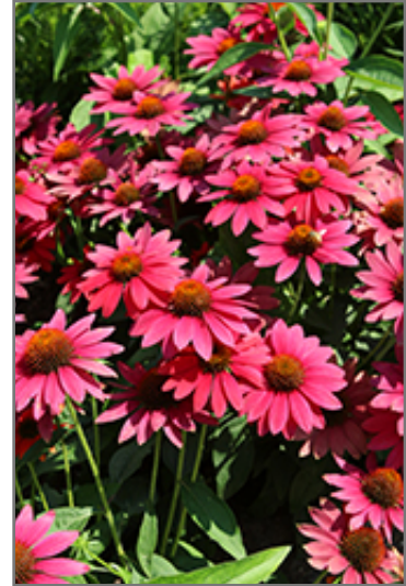
Sombrero Tres Amigos Coneflower flowers

This is a relatively low maintenance plant, and is best cleaned up in early spring before it resumes active growth for the season. It is a good choice for attracting butterflies to your yard, but is not particularly attractive to deer who tend to leave it alone in favor of tastier treats. It has no significant negative characteristics.