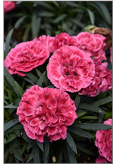
Fruit Punch Raspberry Ruffles Pinks flowers

Fruit Punch Raspberry Ruffles Pinks is recommended for the following landscape applications;