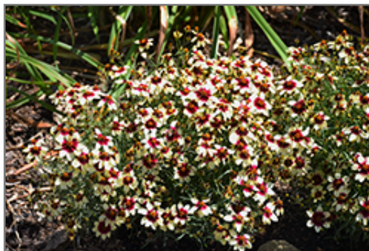
Sizzle And Spice Red Hot Vanilla Tickseed in bloom