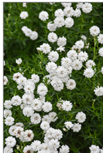
Peter Cottontail Yarrow flowers