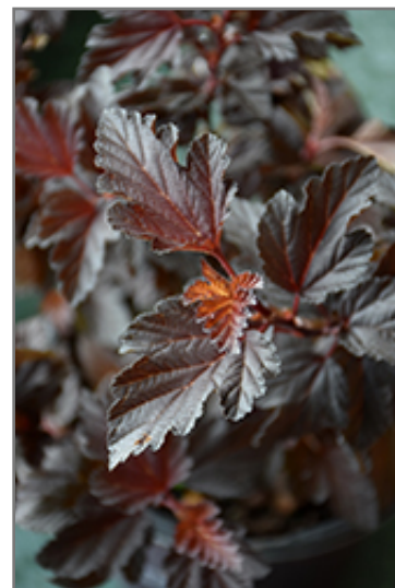
Fireside Ninebark flowers