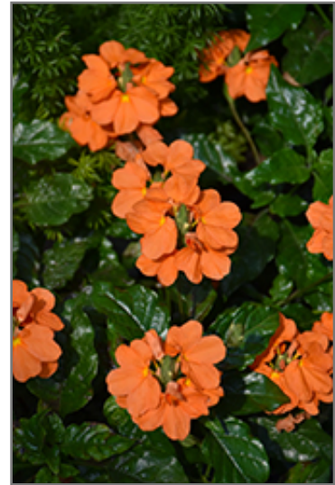
Orange Marmalade Firecracker Plant flowers

This plant does best in full sun to partial shade. It does best in average to evenly moist conditions, but will not tolerate standing water. It is not particular as to soil pH, but grows best in rich soils. It is somewhat tolerant of urban pollution. This is a selected variety of a species not originally from North America. It can be propagated by cuttings; however, as a cultivated variety, be aware that it may be subject to certain restrictions or prohibitions on propagation.