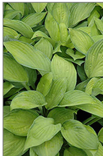
Gold Standard Hosta foliage

Gold Standard Hosta is recommended for the following landscape applications;