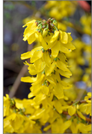
Magical Gold Forsythia flowers

* This is a 'special order' plant - contact store for details