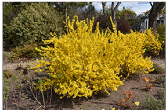
Magical Gold Forsythia in bloom