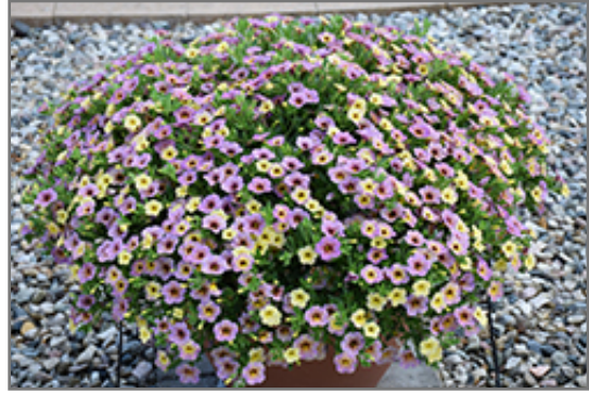
Chameleon Blueberry Scone Calibrachoa in bloom