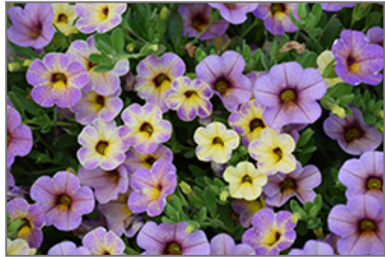
Chameleon Blueberry Scone Calibrachoa flowers

Chameleon Blueberry Scone Calibrachoa is a dense herbaceous annual with a trailing habit of growth, eventually spilling over the edges of hanging baskets and containers. Its medium texture blends into the garden, but can always be balanced by a couple of finer or coarser plants for an effective composition.