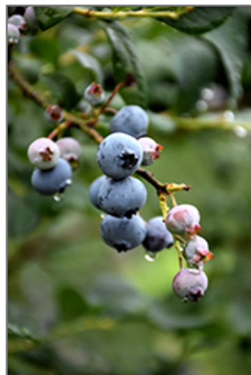
Liberty Blueberry fruit

This is a multi-stemmed deciduous shrub with an upright spreading habit of growth. Its average texture blends into the landscape, but can be balanced by one or two finer or coarser trees or shrubs for an effective composition. This is a relatively low maintenance plant, and usually looks its best without pruning, although it will tolerate pruning. It is a good choice for attracting birds to your yard. It has no significant negative characteristics.