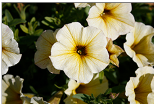
SuperCal Light Yellow Petchoa flowers