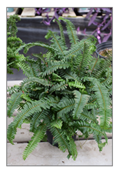
Kimberley Queen Australian Sword Fern in full

When grown indoors, Kimberley Queen Australian Sword Fern can be expected to grow to be about 3 feet tall at maturity, with a spread of 3 feet. It grows at a fast rate, and under ideal conditions can be expected to live for approximately 20 years. This houseplant performs well in both bright or indirect sunlight and strong artificial light, and can therefore be situated in almost any well-lit room or location. It does best in average to evenly moist soil, but will not tolerate standing water. The surface of the soil shouldn't be allowed to dry out completely, and so you should expect to water this plant once and possibly even twice each week. Be aware that your particular watering schedule may vary depending on its location in the room, the pot size, plant size and other conditions; if in doubt, ask one of our experts in the store for advice. It is not particular as to soil pH, but grows best in rich soil. Contact the store for specific recommendations on pre-mixed potting soil for this plant.