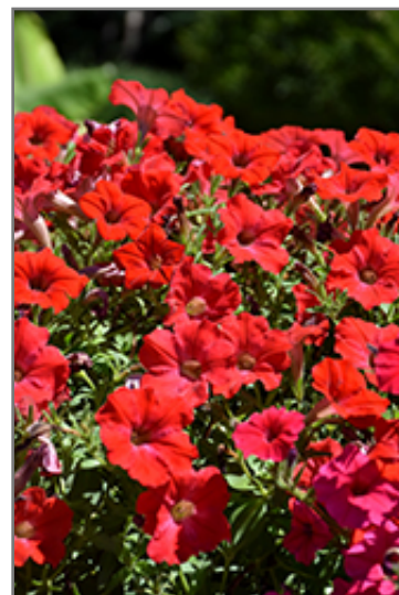
Supertunia Really Red Petunia flowers