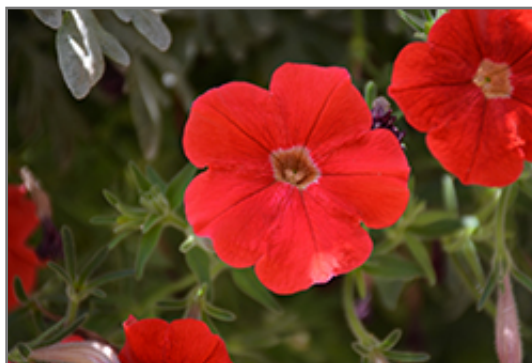
Supertunia Really Red Petunia flowers

This plant will require occasional maintenance and upkeep. Trim off the flower heads after they fade and die to encourage more blooms late into the season. It is a good choice for attracting butterflies and hummingbirds to your yard, but is not particularly attractive to deer who tend to leave it alone in favor of tastier treats. It has no significant negative characteristics.