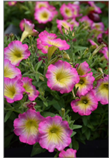
Supertunia Daybreak Charm Petunia flowers

Supertunia Daybreak Charm Petunia is a dense herbaceous annual with a trailing habit of growth, eventually spilling over the edges of hanging baskets and containers. Its medium texture blends into the garden, but can always be balanced by a couple of finer or coarser plants for an effective composition.