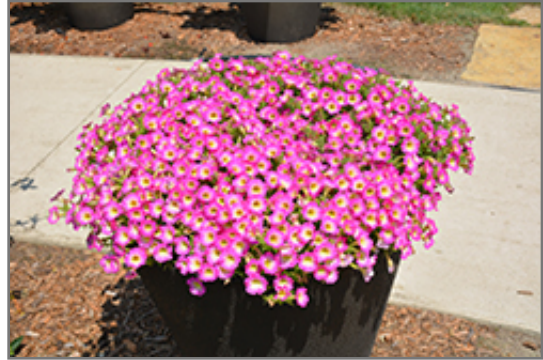
Supertunia Daybreak Charm Petunia in bloom