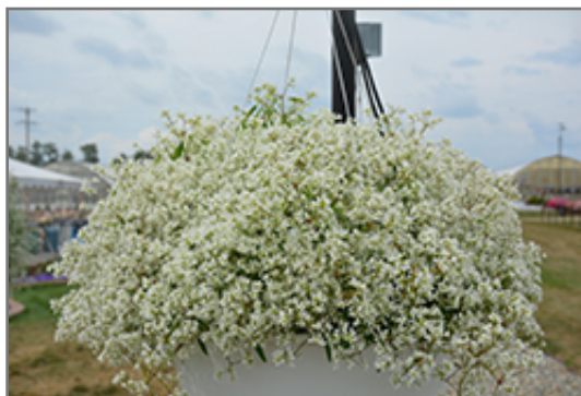
Diamond Delight Euphorbia in bloom

Diamond Delight Euphorbia is recommended for the following landscape applications;