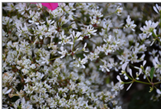
Diamond Delight Euphorbia flowers