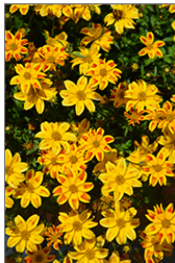
Beedance Red Stripe Bidens flowers

Beedance Red Stripe Bidens is recommended for the following landscape applications;