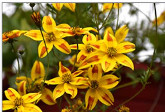
Beedance Red Stripe Bidens flowers