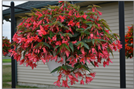
Bossa Nova Pink Glow Begonia in bloom

Bossa Nova Pink Glow Begonia is a fine choice for the garden, but it is also a good selection for planting in outdoor containers and hanging baskets. Because of its trailing habit of growth, it is ideally suited for use as a 'spiller' in the 'spiller-thriller-filler' container combination; plant it near the edges where it can spill gracefully over the pot. Note that when growing plants in outdoor containers and baskets, they may require more frequent waterings than they would in the yard or garden.