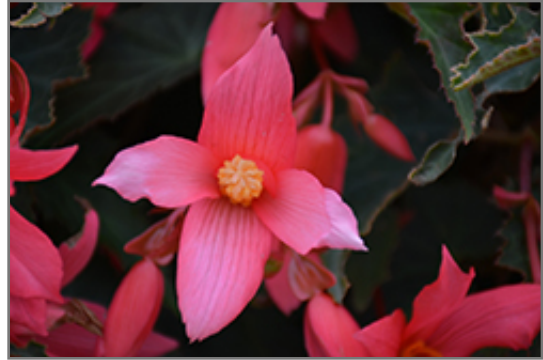
Bossa Nova Pink Glow Begonia flowers

This is a high maintenance plant that will require regular care and upkeep, and usually looks its best without pruning, although it will tolerate pruning. Deer don't particularly care for this plant and will usually leave it alone in favor of tastier treats. Gardeners should be aware of the following characteristic(s) that may warrant special consideration;