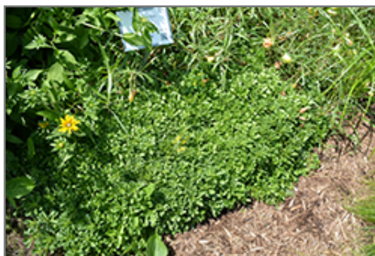
Czar's Gold Stonecrop