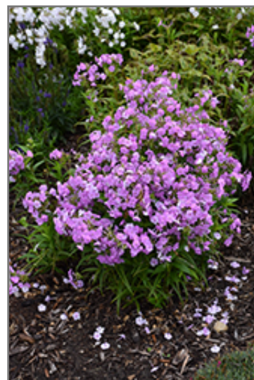
Fashionably Early Princess Garden Phlox in bloom