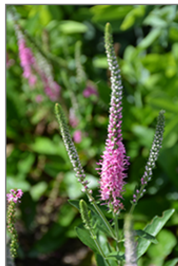
Perfectly Picasso Speedwell flowers