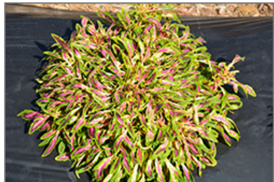
Fancy Feathers Pink Coleus