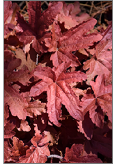
Fun and Games Red Rover Foamy Bells foliage

This is a relatively low maintenance plant, and should be cut back in late fall in preparation for winter. It is a good choice for attracting hummingbirds to your yard. It has no significant negative characteristics.