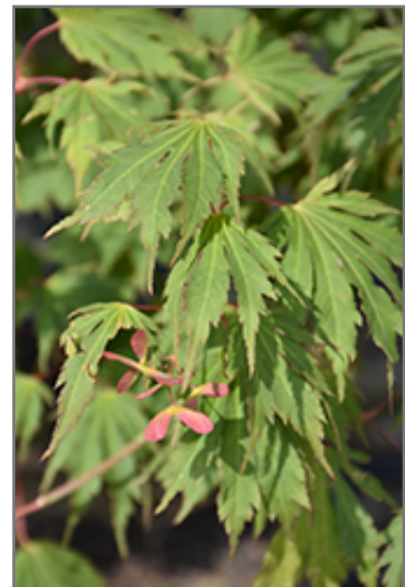
Northern Glow Maple foliage