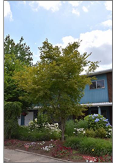
Northern Glow Maple

This tree does best in full sun to partial shade. It does best in average to evenly moist conditions, but will not tolerate standing water. It is not particular as to soil type or pH. It is somewhat tolerant of urban pollution. This particular variety is an interspecific hybrid.