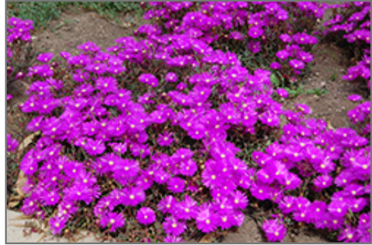
Jewel Of Desert Opal Ice Plant in bloom

Jewel Of Desert Opal Ice Plant will grow to be only 4 inches tall at maturity extending to 6 inches tall with the flowers, with a spread of 10 inches. When grown in masses or used as a bedding plant, individual plants should be spaced approximately 10 inches apart. Its foliage tends to remain low and dense right to the ground. It grows at a fast rate, and under ideal conditions can be expected to live for approximately 5 years. As an evergreen perennial, this plant will typically keep its form and foliage year-round.