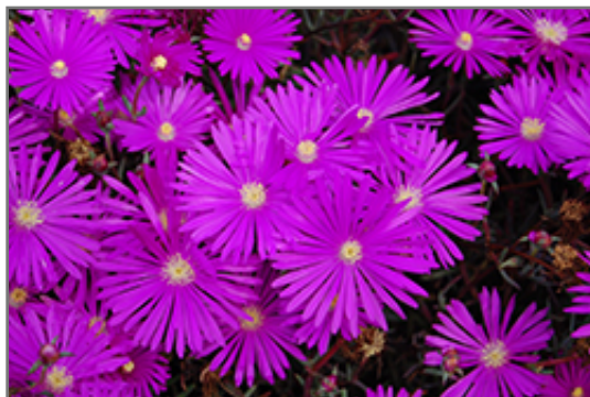
Jewel Of Desert Opal Ice Plant flowers