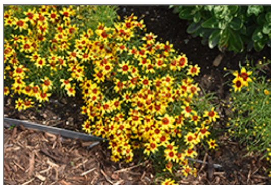
Sizzle And Spice Curry Up Tickseed in bloom