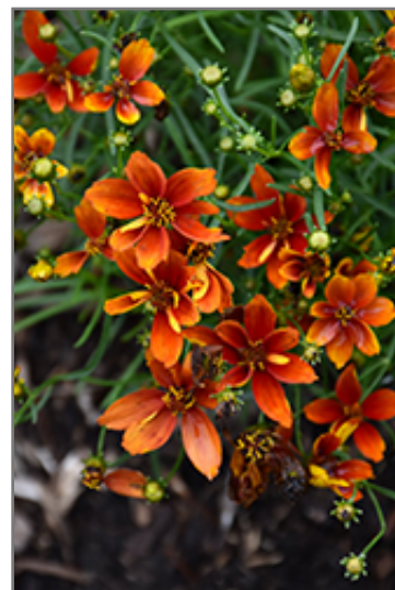
Sizzle And Spice Crazy Cayenne Tickseed flowers

Sizzle And Spice Crazy Cayenne Tickseed is recommended for the following landscape applications;