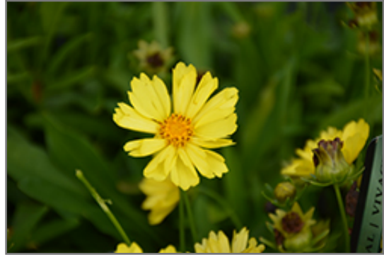
Leading Lady Sophia Tickseed flowers

Leading Lady Sophia Tickseed is recommended for the following landscape applications;