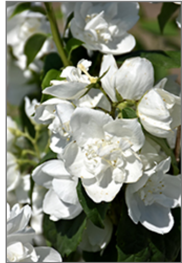
Snow White Mockorange flowers

Snow White Mockorange will grow to be about 6 feet tall at maturity, with a spread of 5 feet. It tends to fill out right to the ground and therefore doesn't necessarily require facer plants in front, and is suitable for planting under power lines. It grows at a fast rate, and under ideal conditions can be expected to live for approximately 30 years.