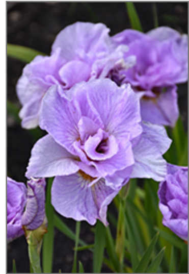
Pink Parfait Siberian Iris flowers