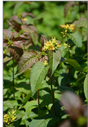
Kodiak Black Diervilla flowers