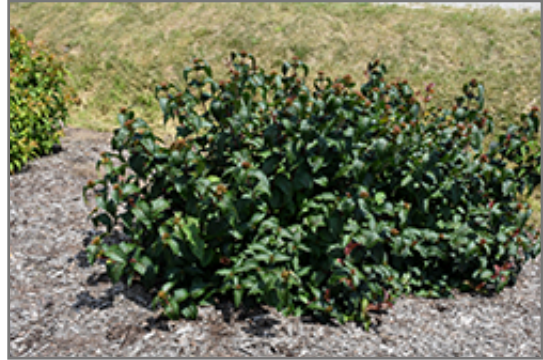
Kodiak Black Diervilla