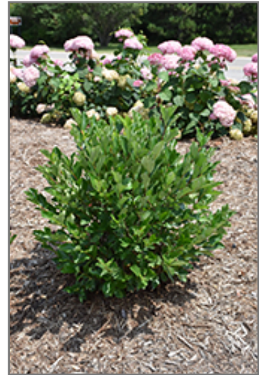
Low Scape Hedger Aronia