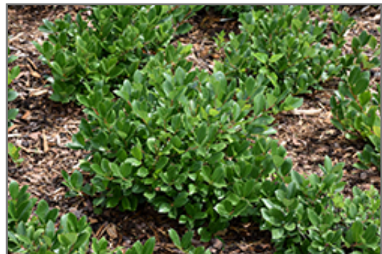
Low Scape Hedger Aronia